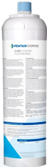
Head sold separately.

CLARIS ULTRA 1500 FILTER CARTRIDGE: 4339-83